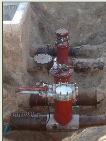
Insta-Valve Plus can be installed with your existing Hydra-Stop equipment or as a stand alone system. Easy installation makes the Insta-Valve Plus a versatile part of the Hydra-Stop System.